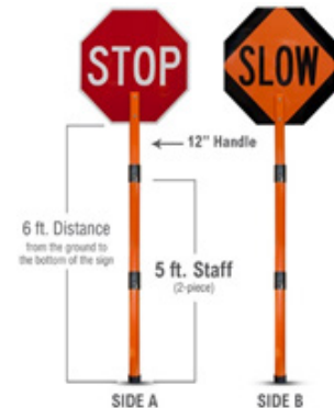
Stop/Slow Flagger Paddle

Always reference MUTCD or consult County Engineer for proper traffic control applications.