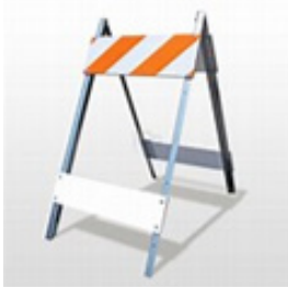
Type 1 (Low speed Roads)