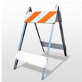
Type 1 (Low speed Roads)